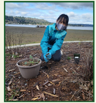
Landscaping, Sunset Beach