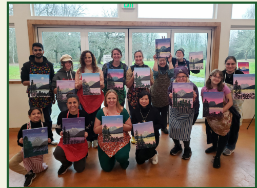
Painting in the Park