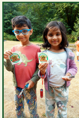
Camp S'more Junior Rangers