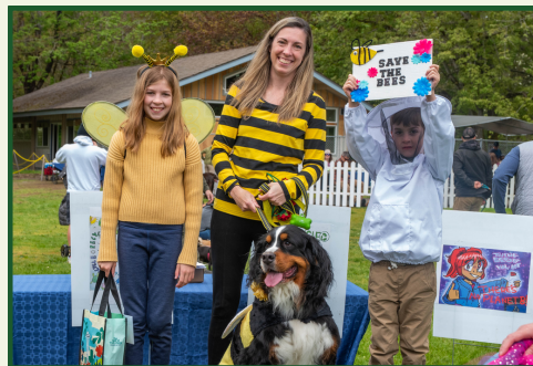
Walk n' Wag: Best Costume Winners