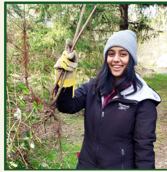
Habitat Restoration, Tibbetts Creek

Hosted 6 free and successful events centered on education and art including an introduction to the iNaturalist app; intro to birding; nature writing workshop; history walk; salmon sleuthing walk; and painting in the park instruction