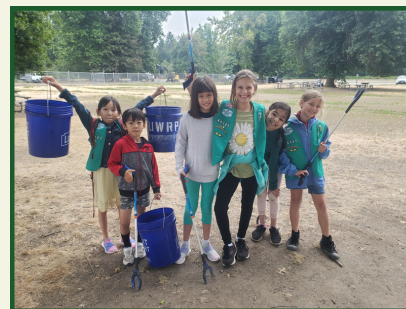
Summer Litter Pickup

Supported Trail design work for accessible trail improvements that will create a new loop throughout the park using the funding we secured for our Comprehensive Trails Plan