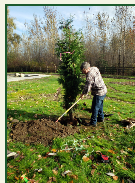
Replacement Shade Trees