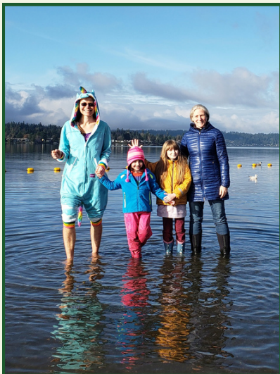
Polar Plunge: Best Costume Winners