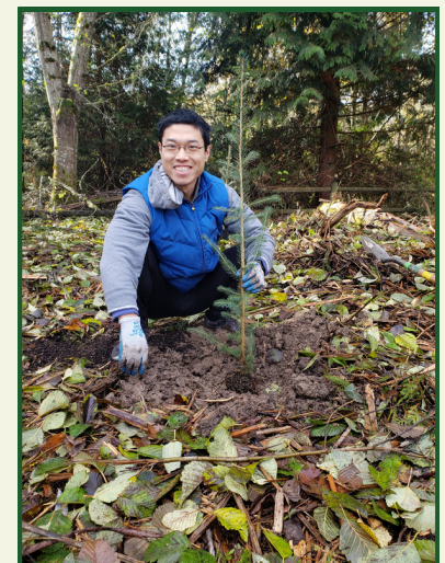
Native Tree Planting, Tibbetts Creek