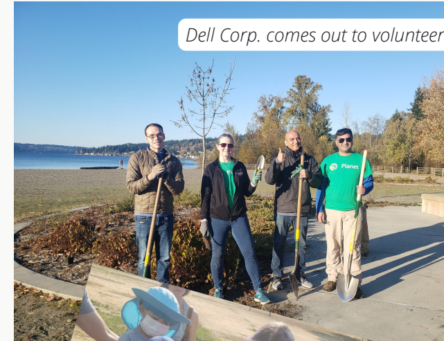
Dell Corp. comes out to volunteer