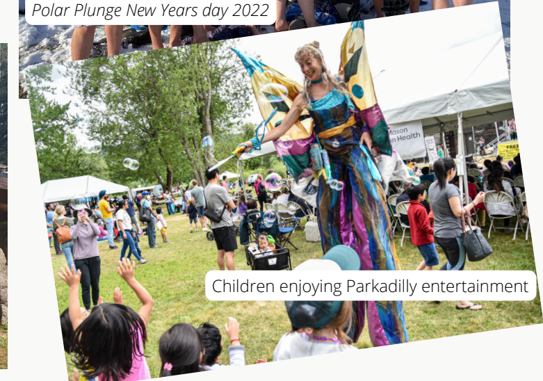
Children enjoying Parkadilly entertainment