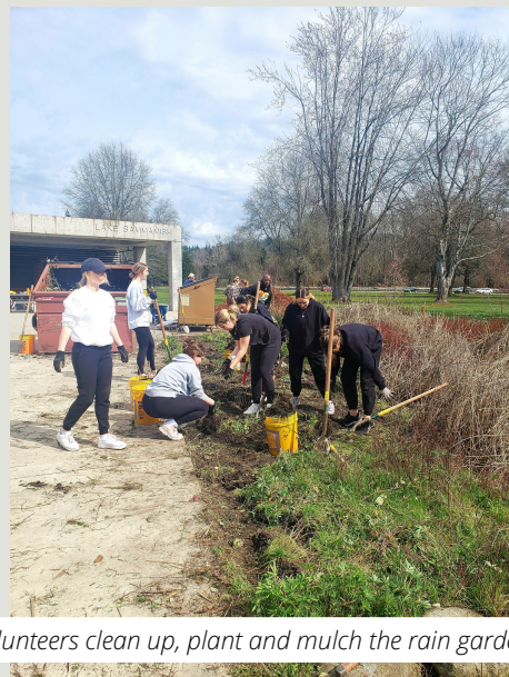
Volunteers clean up, plant and mulch the rain garden.

Friends of Lake Sammamish State Park is a non-profit 501(c)(3) organization dedicated to supporting, enhancing and promoting Lake Sammamish State Park for the benefit of our entire community.