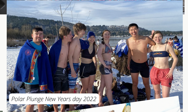
Polar Plunge New Years day 2022