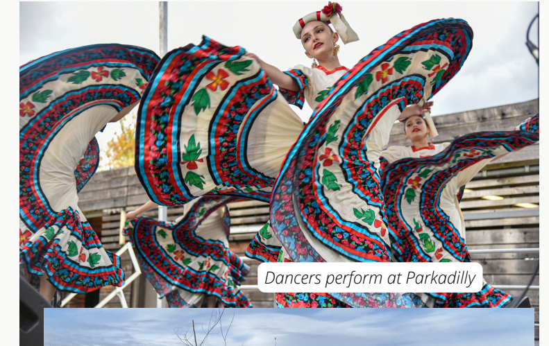
Dancers perform at Parkadilly