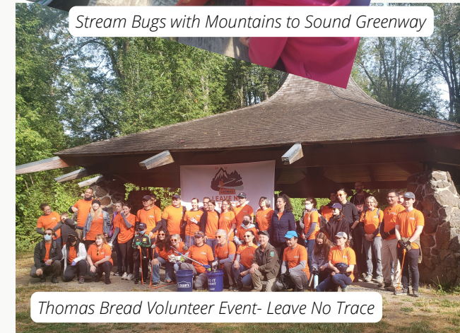
Thomas Bread Volunteer Event- Leave No Trace