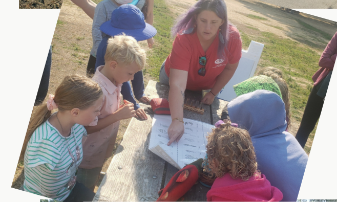
Stream Bugs with Mountains to Sound Greenway