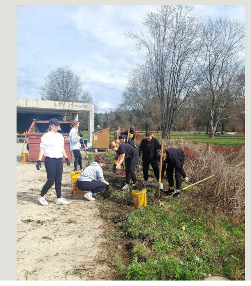
Volunteers clean up, plant and mulch the rain garden.

INCOME Donations ■ Govt Grants ■ Trail Donations ■ Events