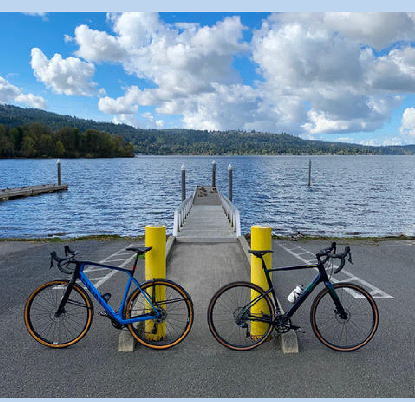
Supporting, Promoting & Enhancing